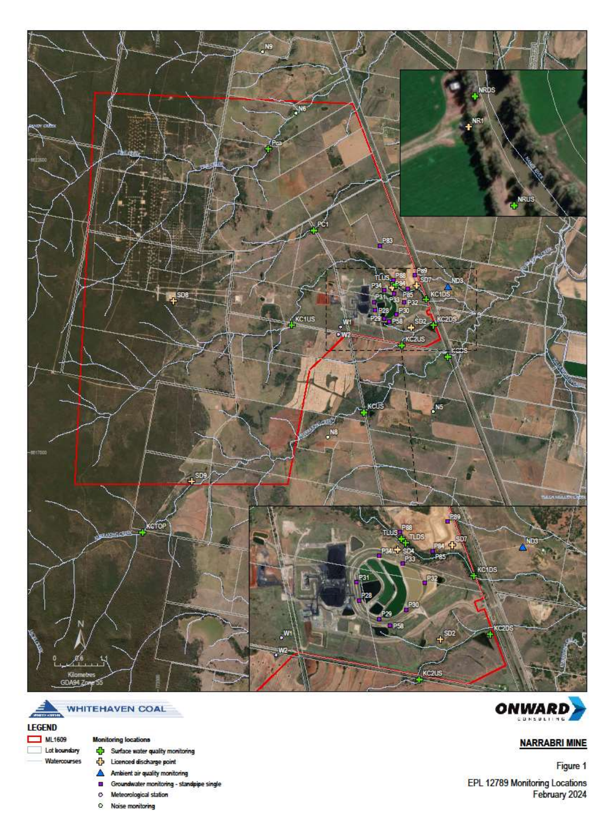
Figure 1 – EPL 12789 Monitoring Locations